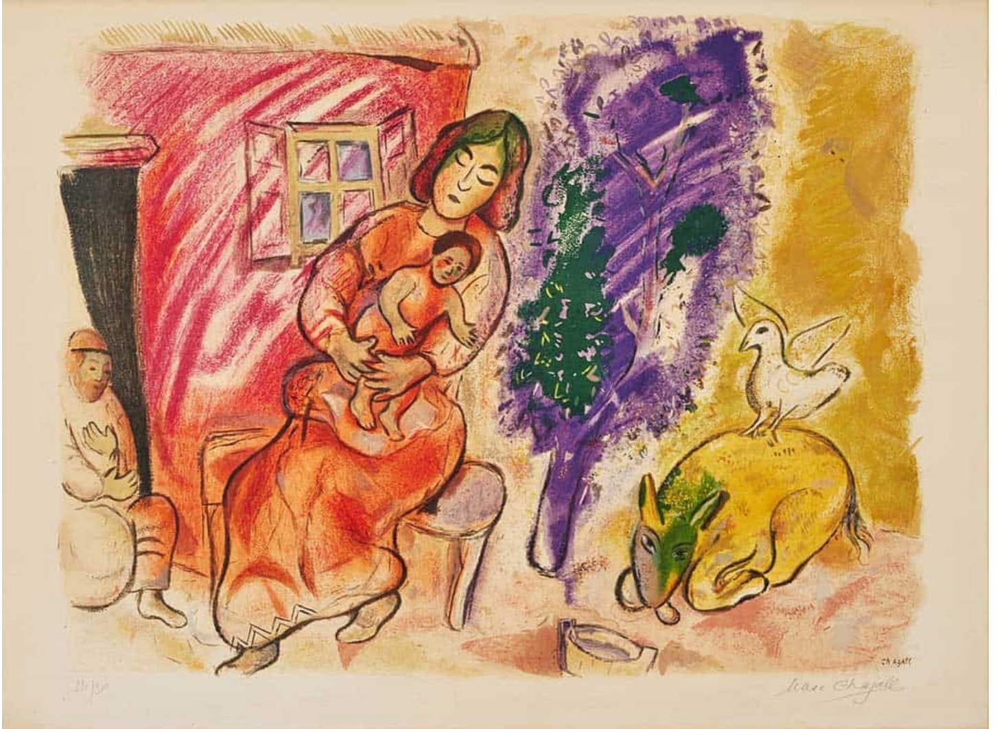
Maternité - Chagall, Marc 1954 Colour Lithograph