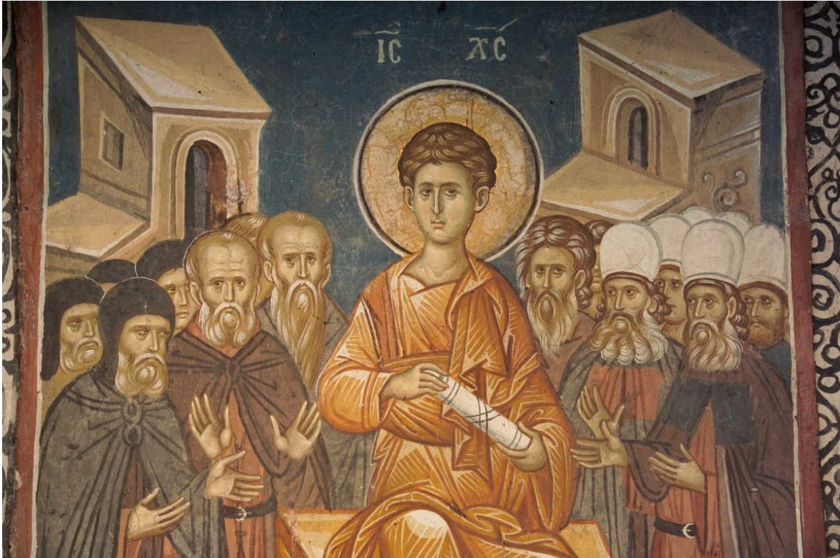
Jesus among the teachers in the Temple, 14th century fresco from the Vysokie Dechani monastery, Serbia.