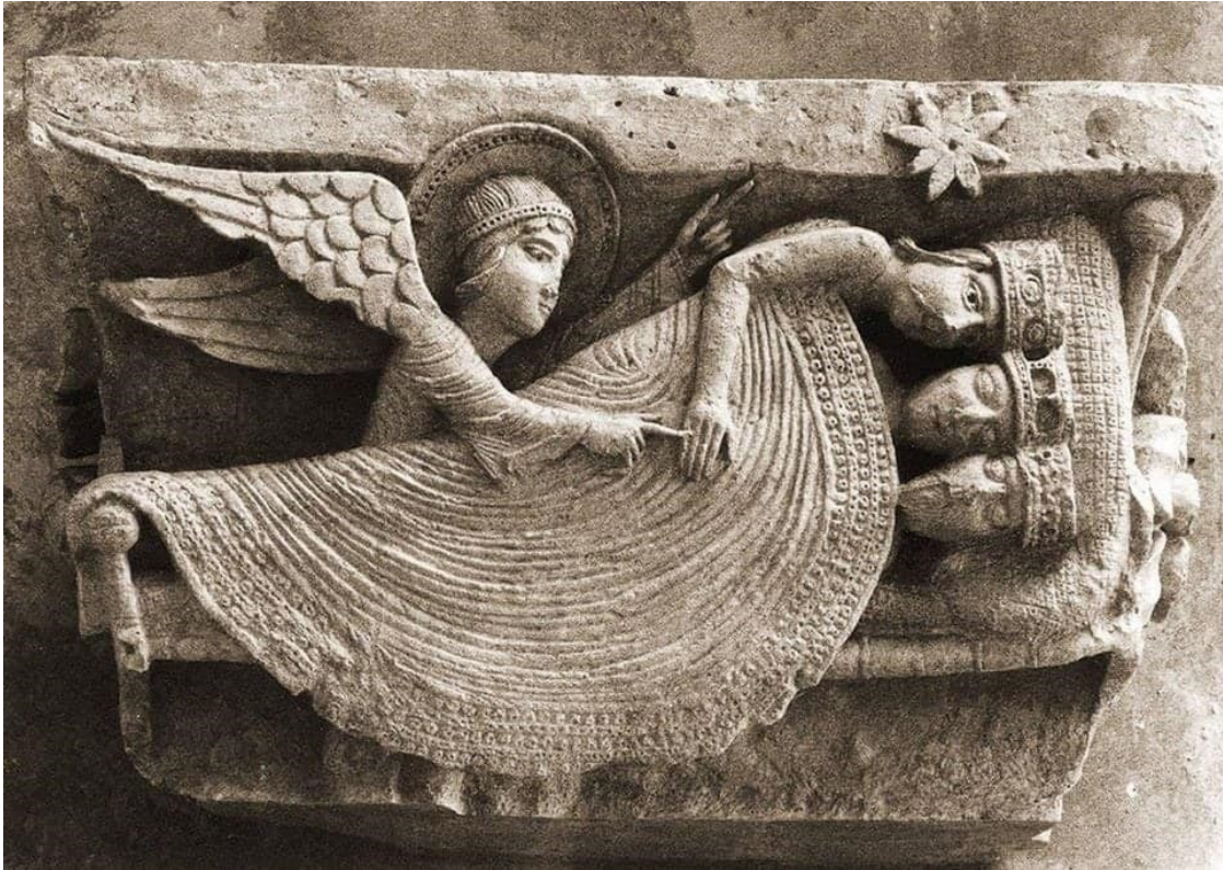
Dream of the Magi by French sculptor Gislebertus, Cathedral of St Lazare in Autun, France, 12th century .