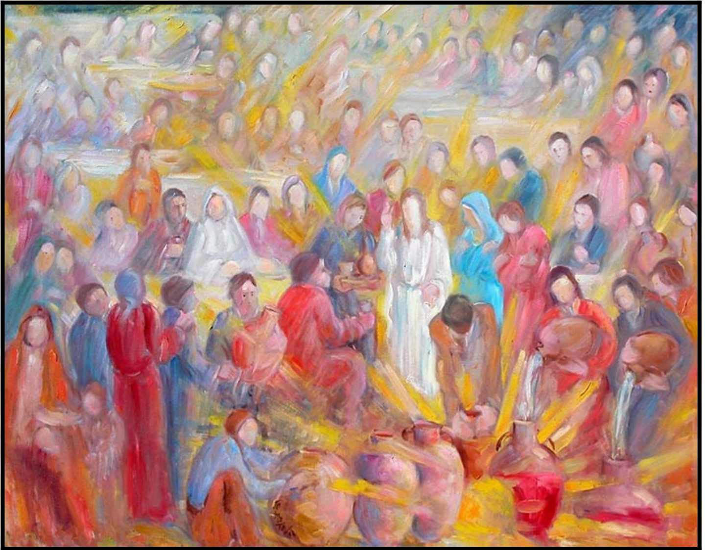
The Wedding at Cana , Joseph Matar, 1993 Oil on canvas