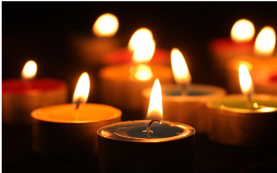
All Souls Day