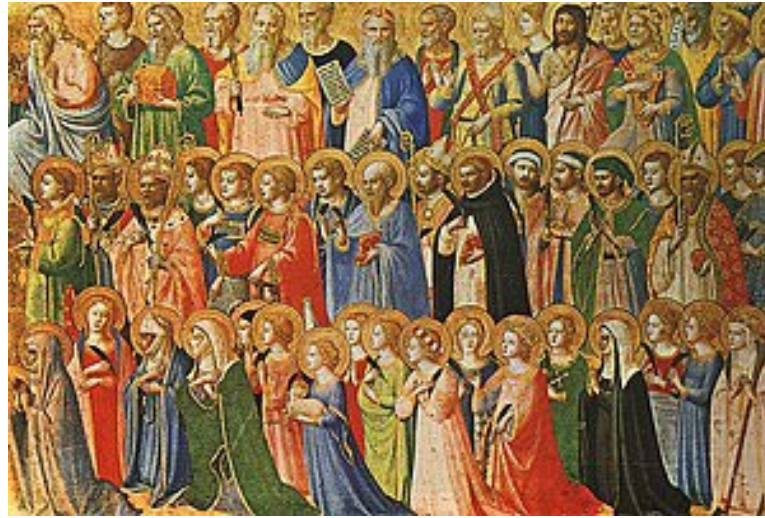
All Saints Day