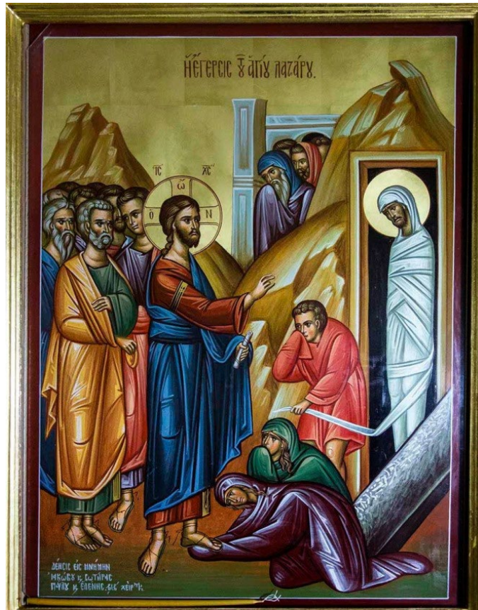
Mary, Martha and Lazarus