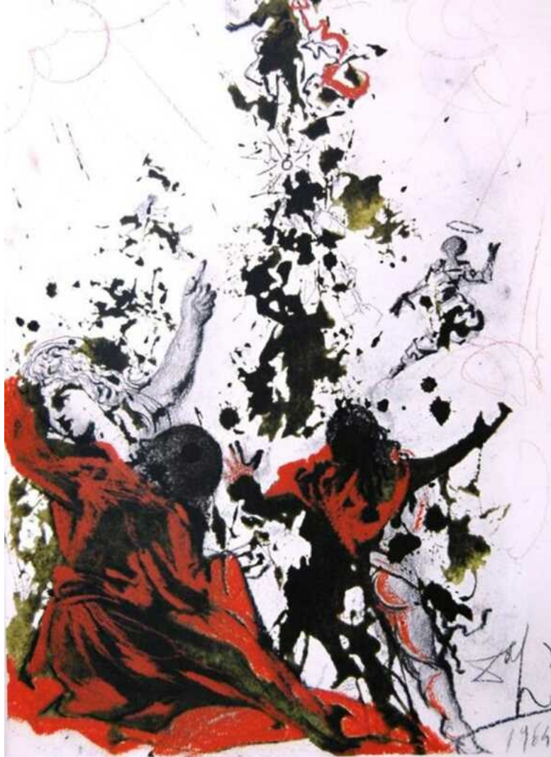
The Transfiguration of Jesus , Salvadore Dali, 1967 Lithograph on Heavy Rag Paper