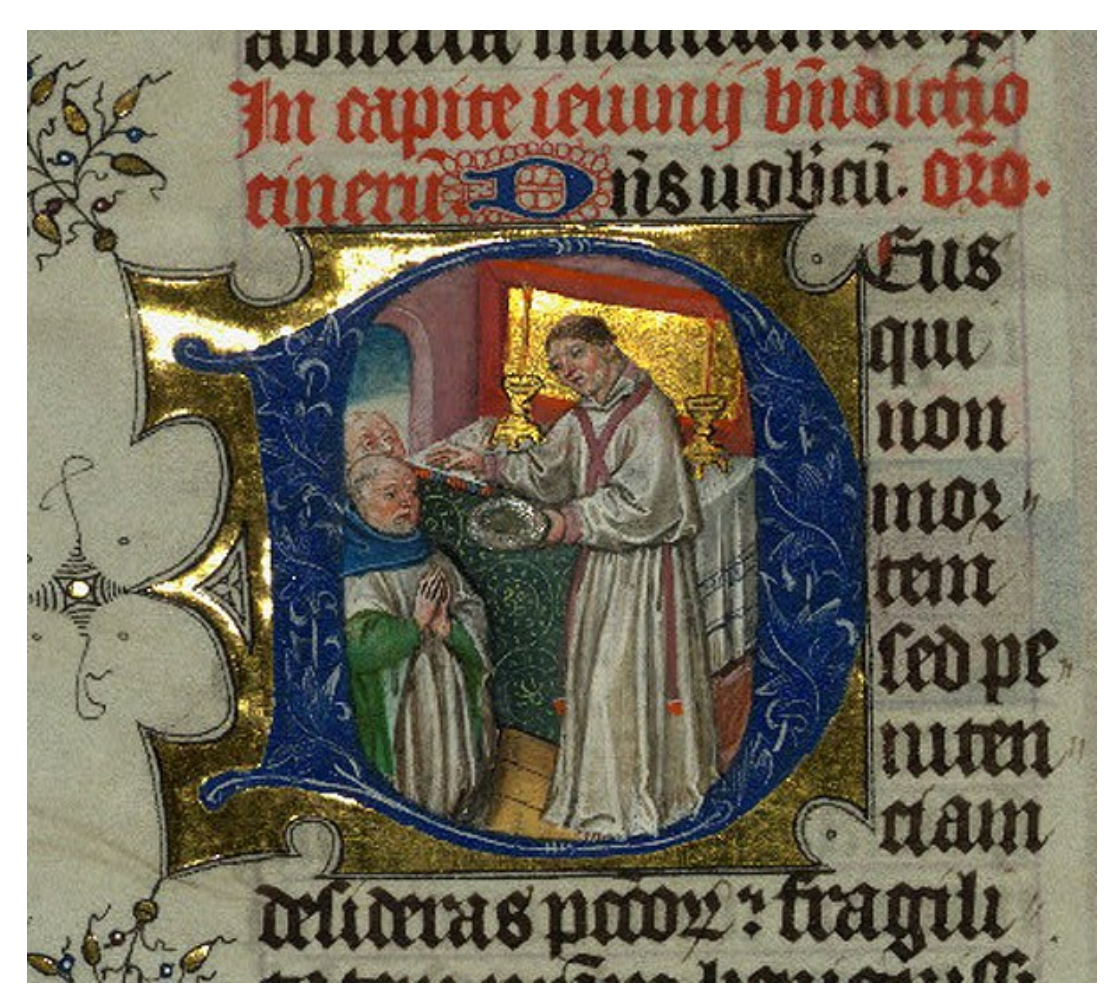
Baltimore: Walters Art Museum, W. 174, Missal of Eberhard von Greiffenklau, fol. 28r; initial D at beginning of prayer during the blessing of ashes on Ash Wednesday