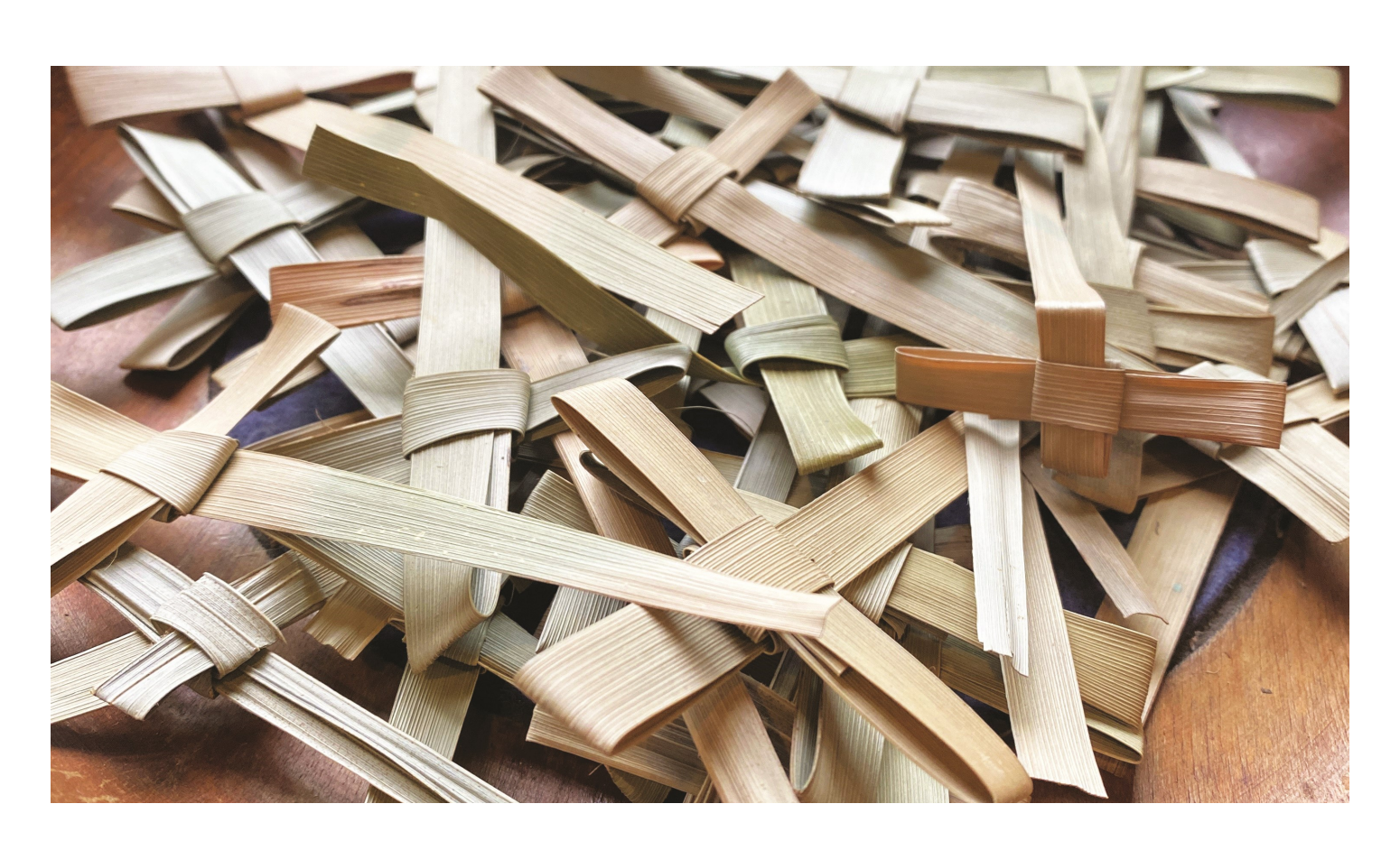
The Ash used on Ash Wednesday is prepared by burning the palm crosses from Palm Sunday last year.

The Procession makes its way out of the church in silence.