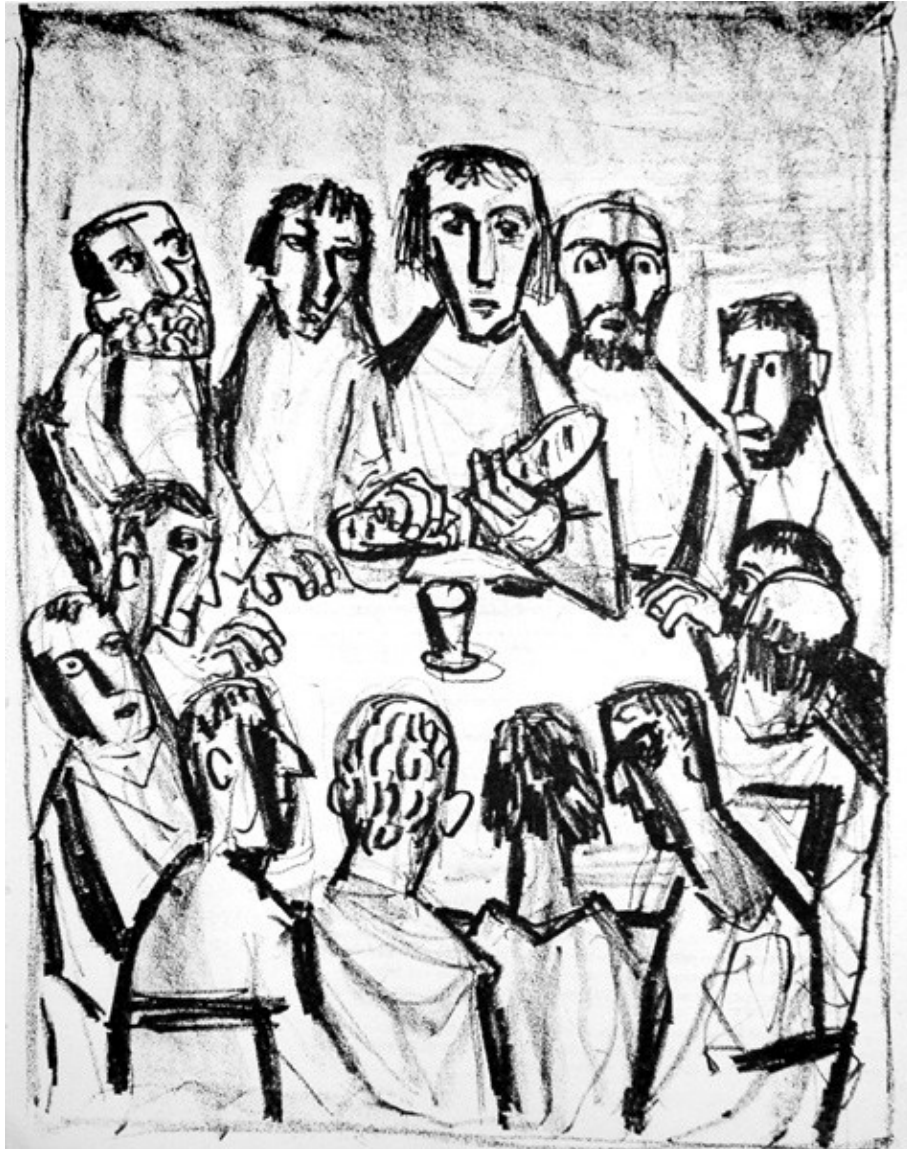
Das Abendmahl , Otto Dix, 1960 Lithograph