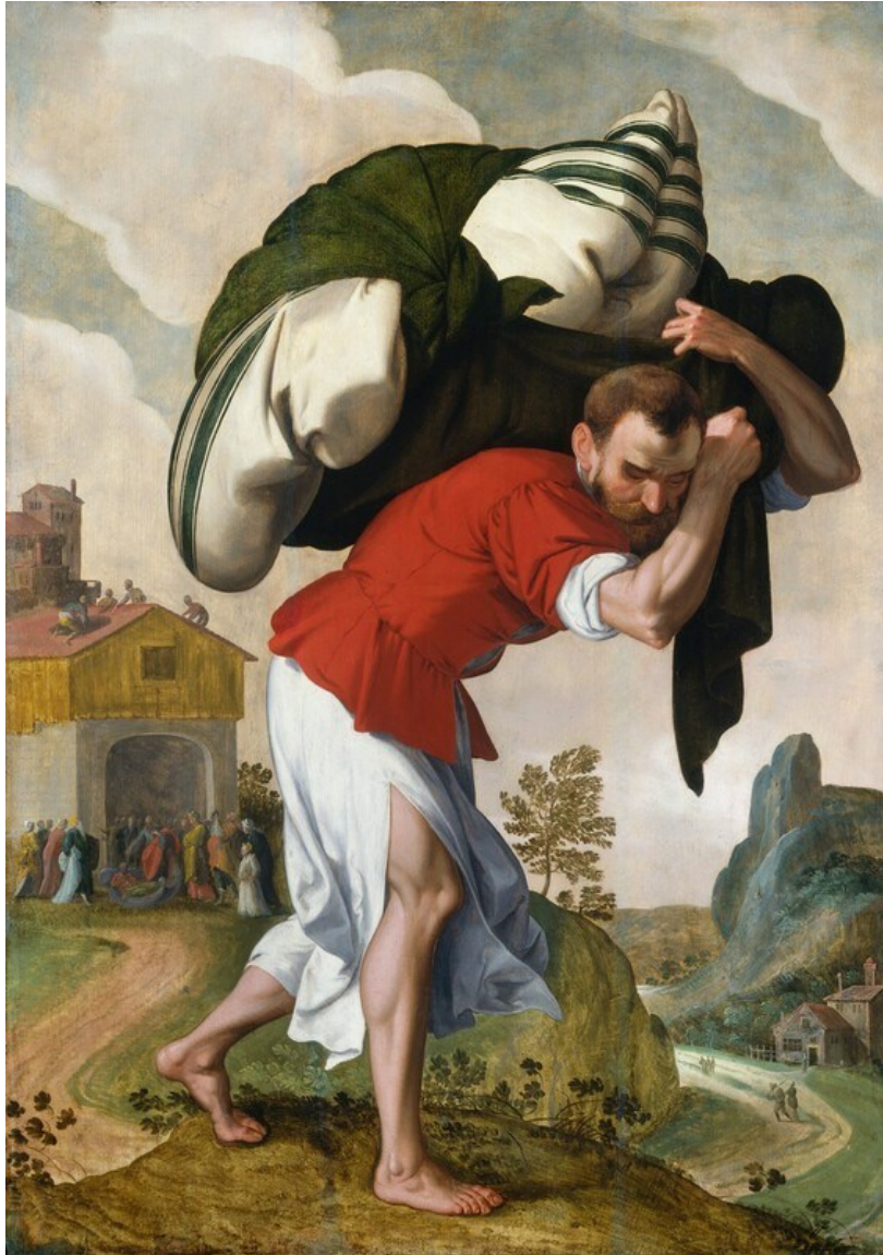
The Healing of the Paralytic , Unknown Painter, c. 1560/1590 Oil on Panel (Chester Dale Collection, National Gallery of Art)