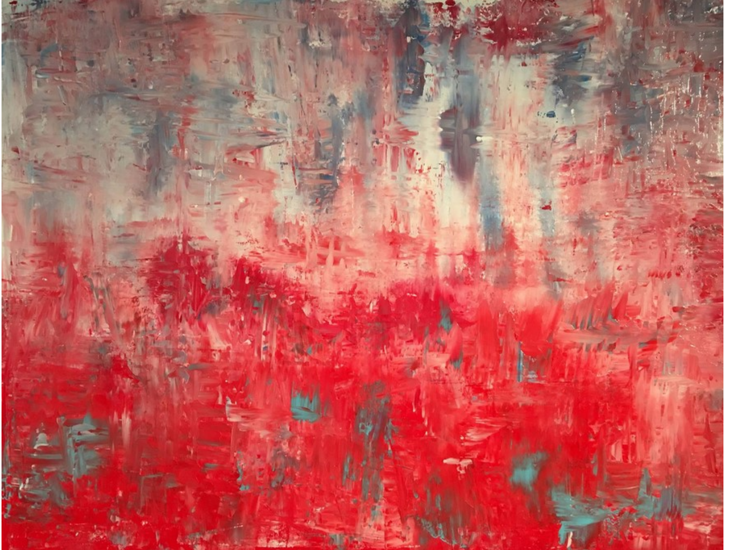
Water Into Wine , Richard Rice, 2017 Acrylic on Canvas