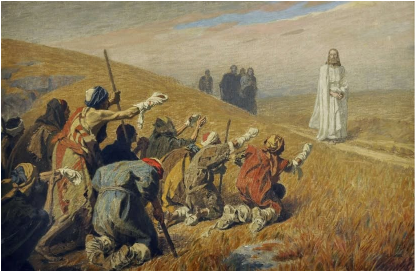
Christ and the Lepers , Gebhard Fugel, 1920 Oil on Canvas

As Sydney's oldest church, St James' is a place of soul-stirring worship, challenging preaching and fine music. We are a progressive community that welcomes all people regardless of age, race, sexual orientation, gender identity, or religion.